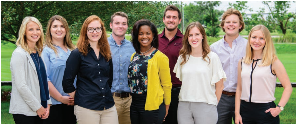
2018 Asphalt Institute Foundation Internship Program Participants

The foundation is focused on continued growth of the internship program in 2019. The fourth annual program will take place on June 19-20, 2019, at the Asphalt Institute headquarters in Lexington, KY. Additionally, interns participating in this year’s program will have the opportunity to attend AI’s Summer Meeting in Chicago, IL, August 5-8, as we continue celebrating the institute’s centennial.