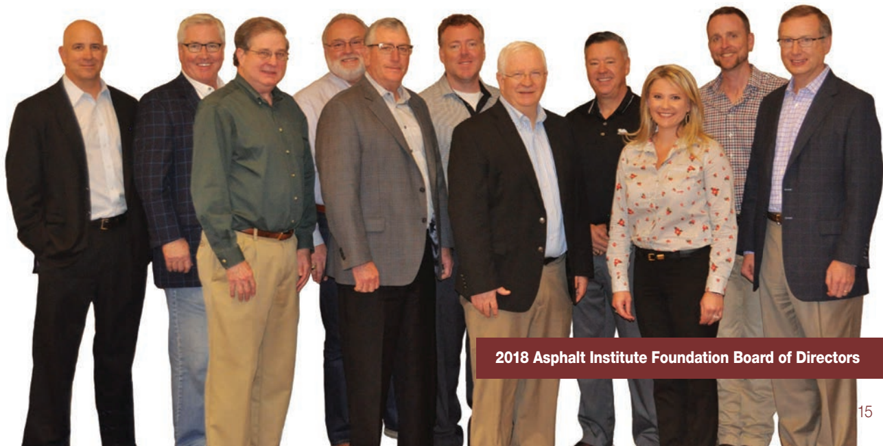
2018 Asphalt Institute Foundation Board of Directors