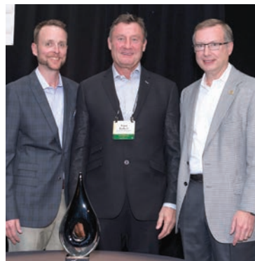
2018 Asphalt Institute Foundation Fellows – Asphalt & Fuel Supply, LLC, Jebro Inc. and Suit-Kote Corporation