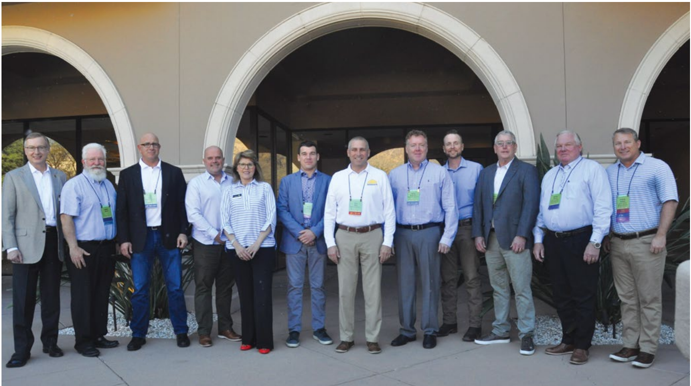
AIF 2021 Board of Directors

the Ergon Foundation's $1 million commitment. The annual AIF Golf Scramble fundraising event resumed in 2021 bringing in net donations of $51k from sponsors and players. Net investment income from all investment funds amounted to $255k. The audited Statement of Activities is showing a $560k increase in net assets for 2021 compared to $413k increase in the prior year. The solid financial performance gives the Foundation the resources to continue its robust support of growing strategic research and educational activities in 2022.